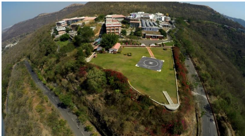
Lavale, Pune Campus